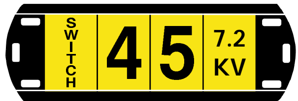
Horizontally oriented PH104 (shown smaller than actual size)