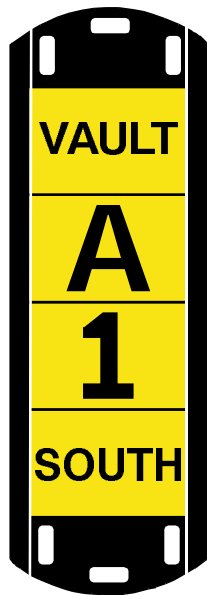
Vertically oriented PH104 (shown smaller than actual size)

For tag specification see SPEC1EVL or SPEC1_3D